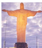
March 20 th The Man Who Belongs to the World