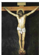
March 6 th The Son of Man/Christ Crucified