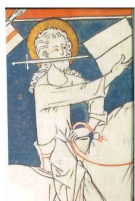
March 13 th The Liberator